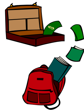
Grants & Subsidies